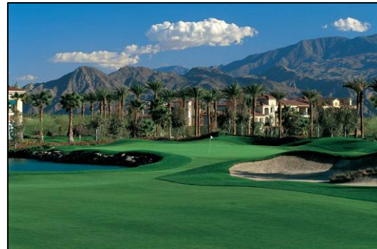
Marriott's Shadow Ridge